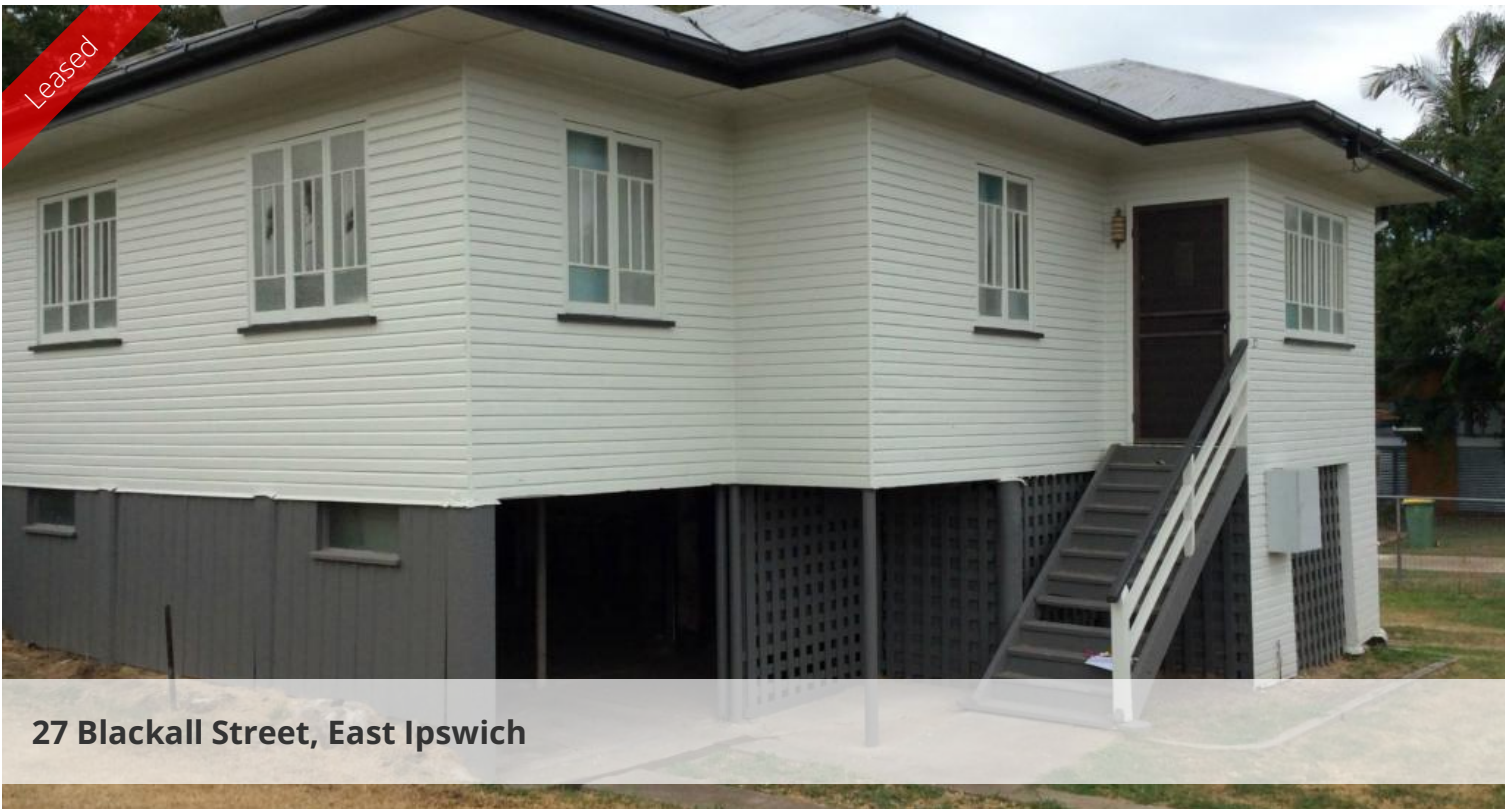
27 Blackall Street, East Ipswich