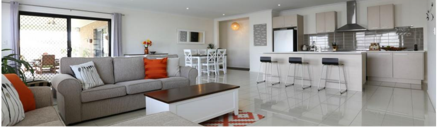
12 Baystone Place, Raceview