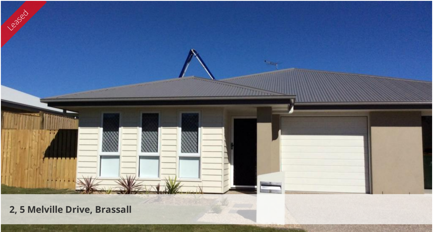
2, 5 Melville Drive, Brassall