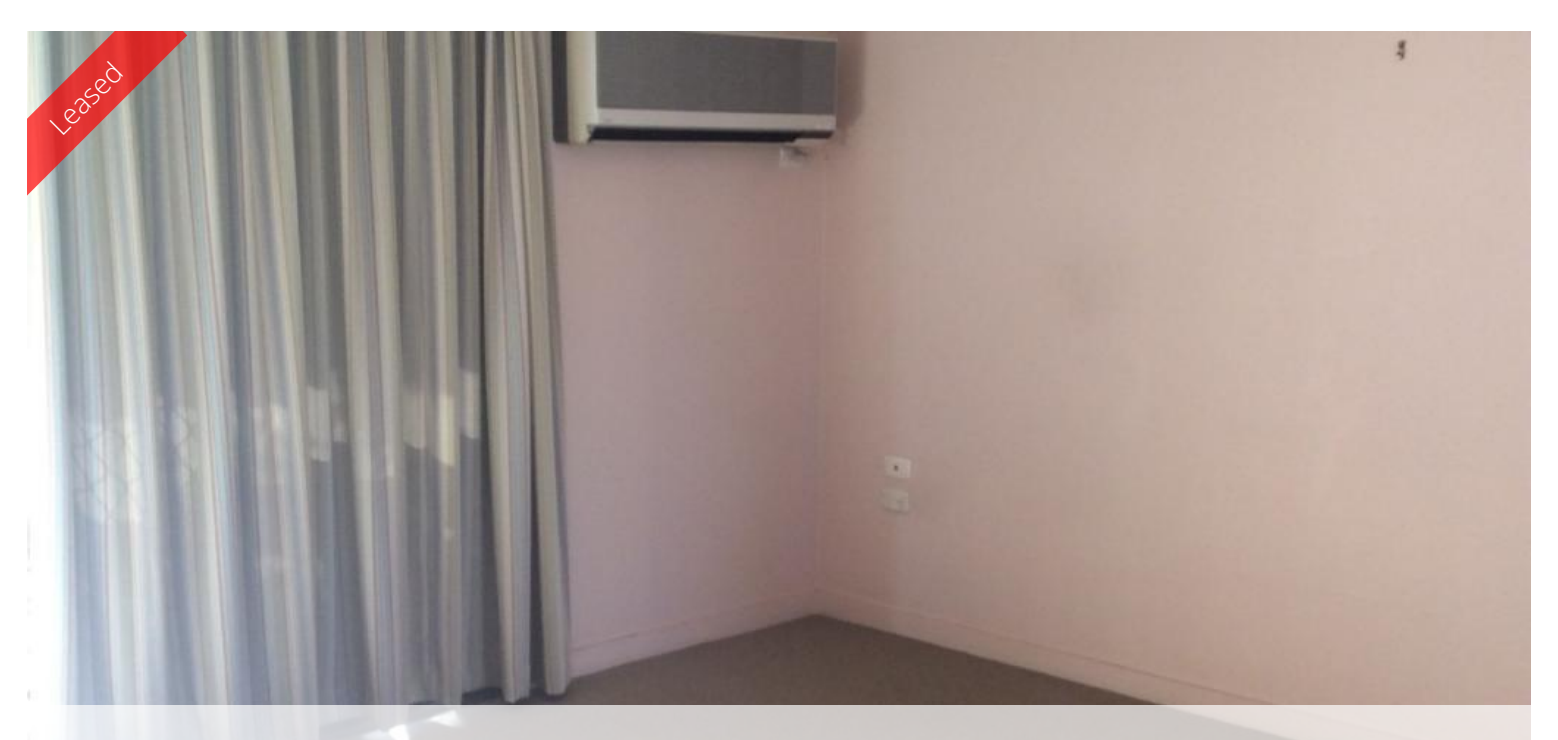
16, 39 Thorn Street, Ipswich