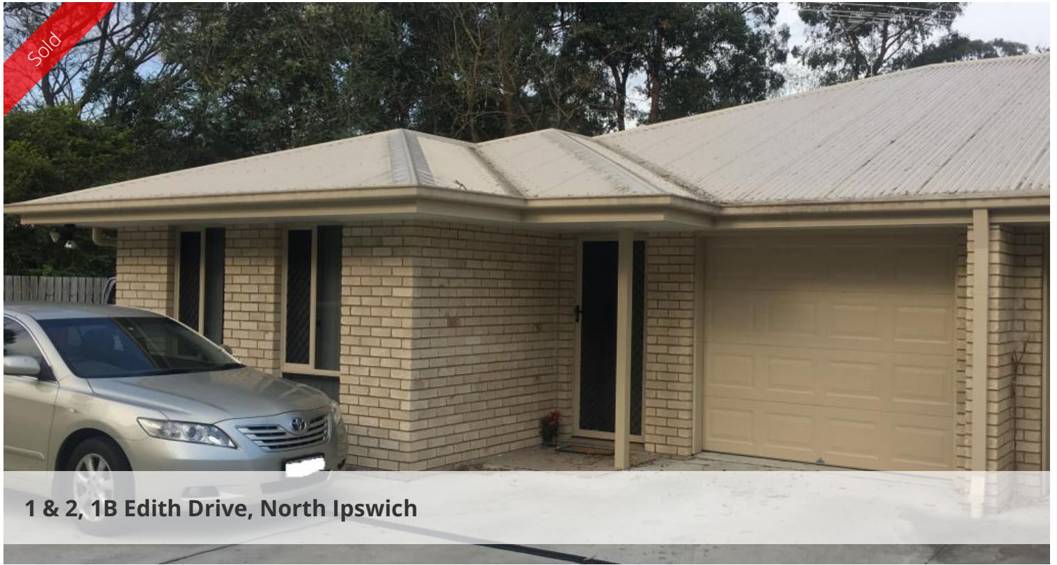
1 & 2, 1B Edith Drive, North Ipswich