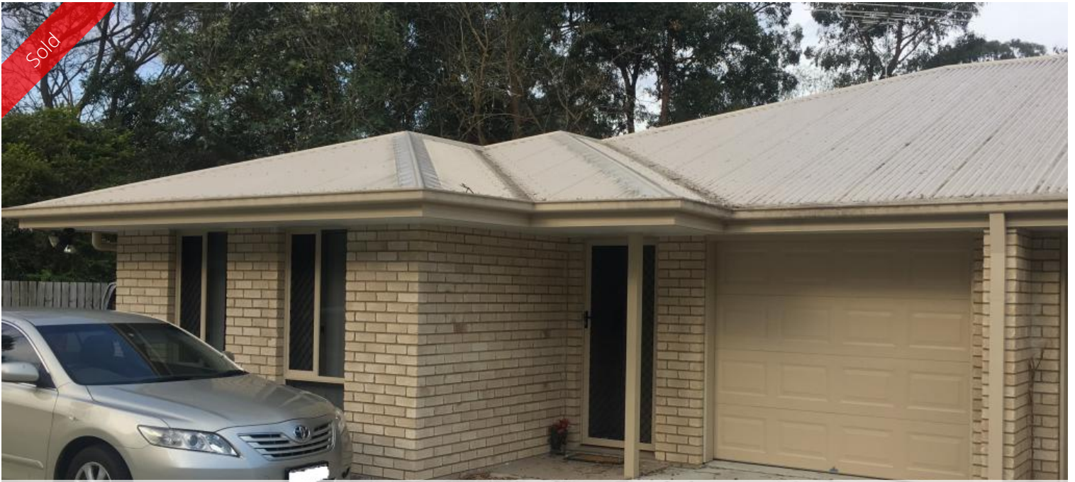
1 & 2, 1B Edith Drive, North Ipswich