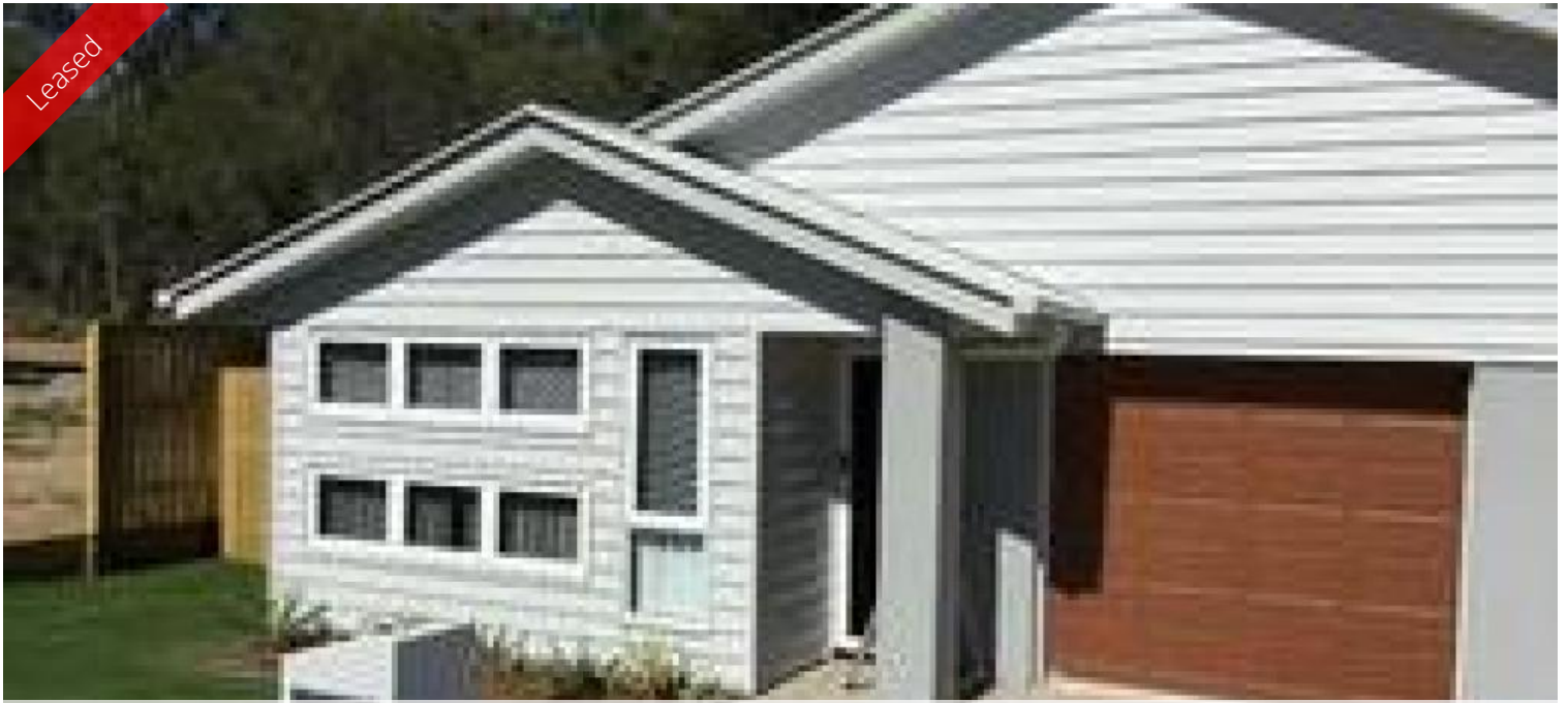
Unit 1, 11 Kains Ave, Brassall