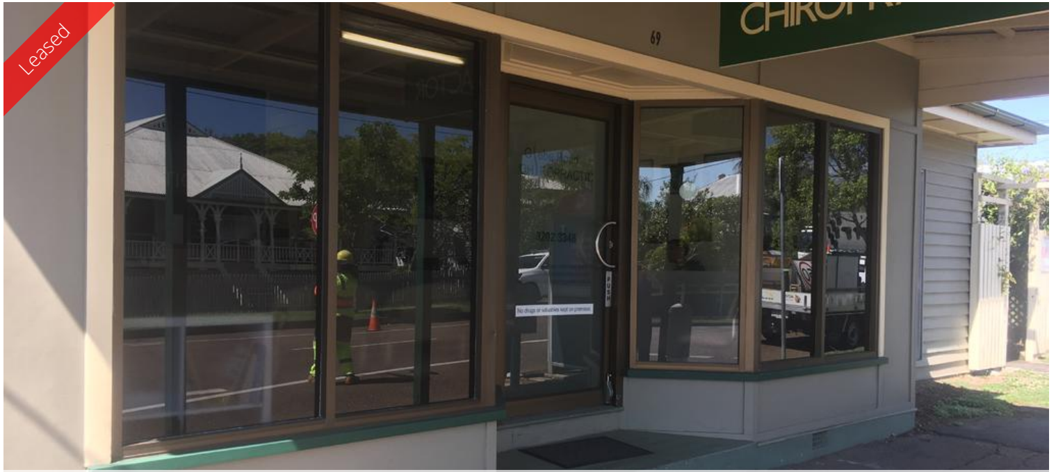
Shop 1, 69 Glebe Rd, Silkstone