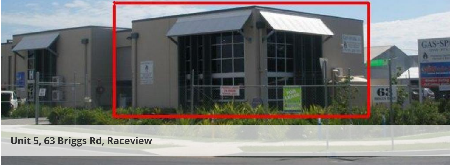
Unit 5, 63 Briggs Rd, Raceview