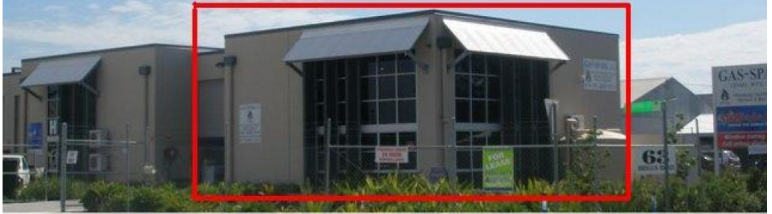
Unit 5, 63 Briggs Rd, Raceview