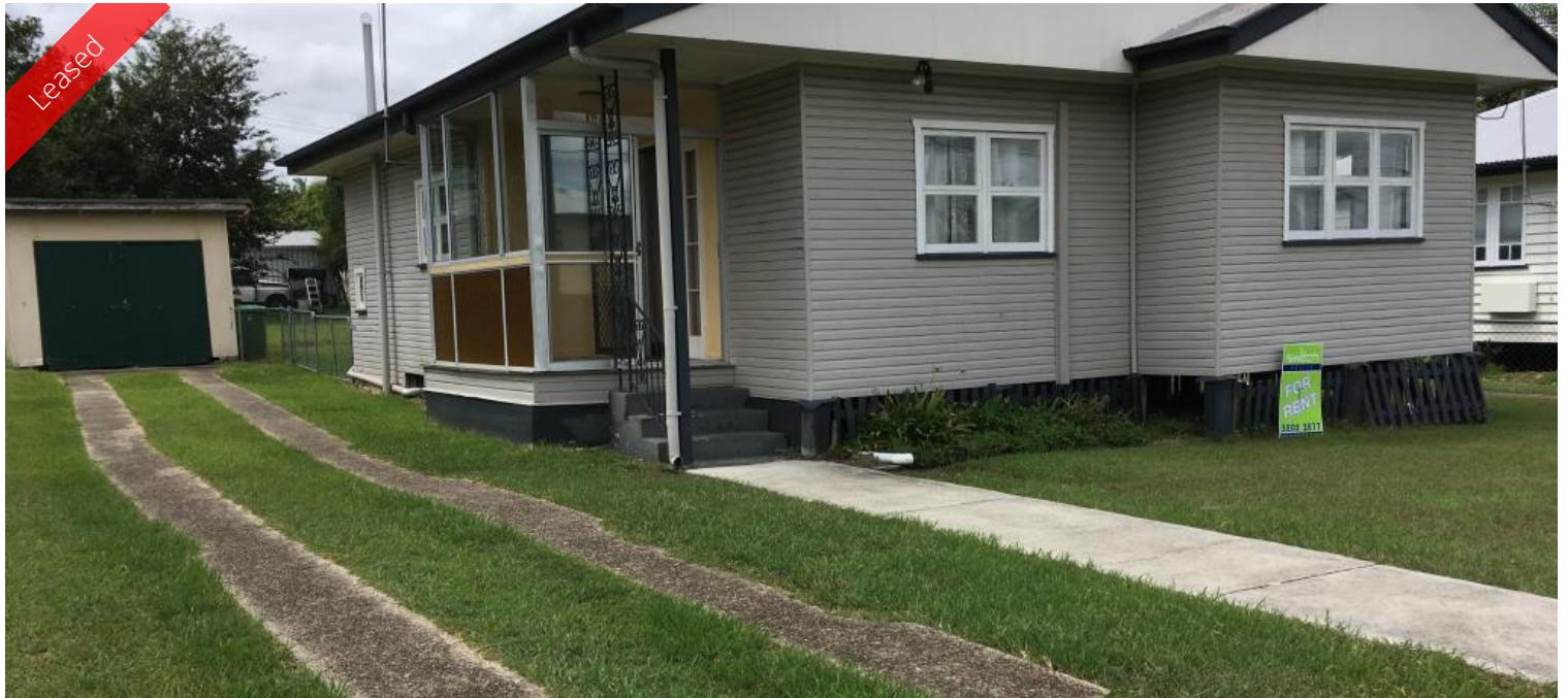
152 South Station Rd, Silkstone