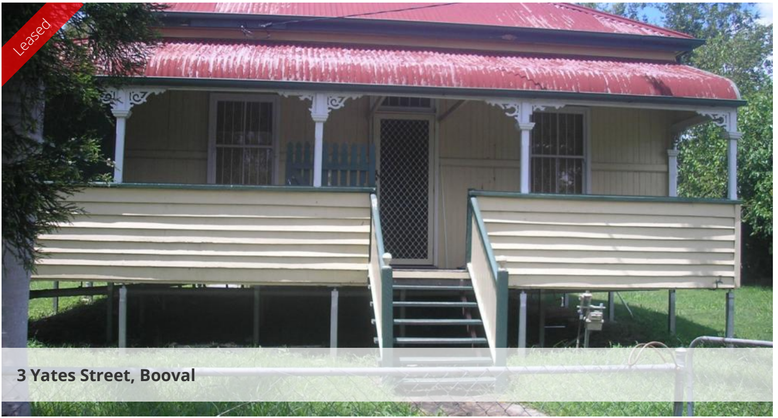
3 Yates Street, Booval