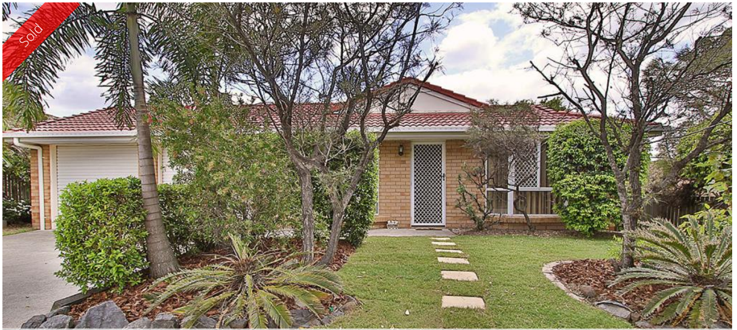
244 Edwards Street, Raceview