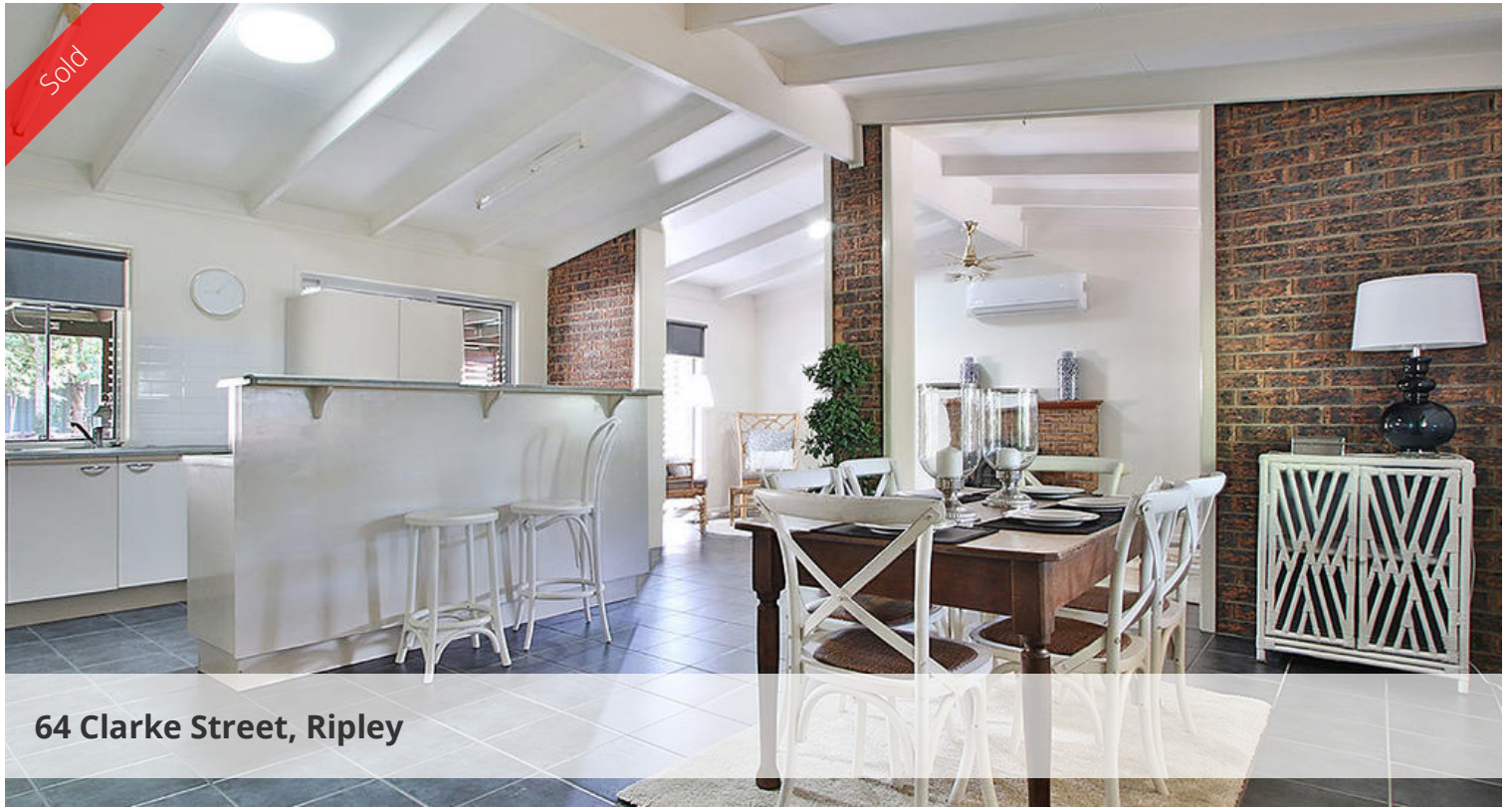
64 Clarke Street, Ripley