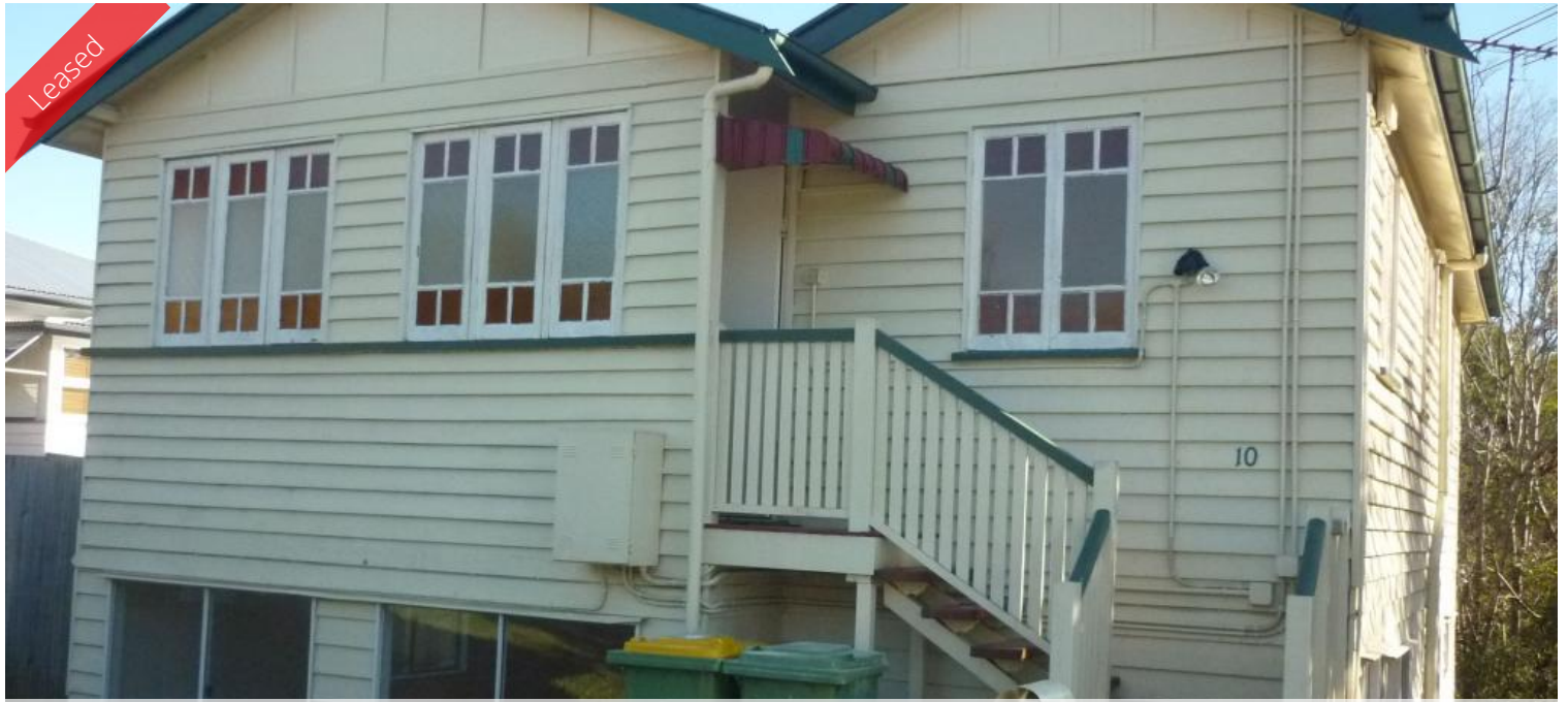
10 Gulland Street, North Ipswich