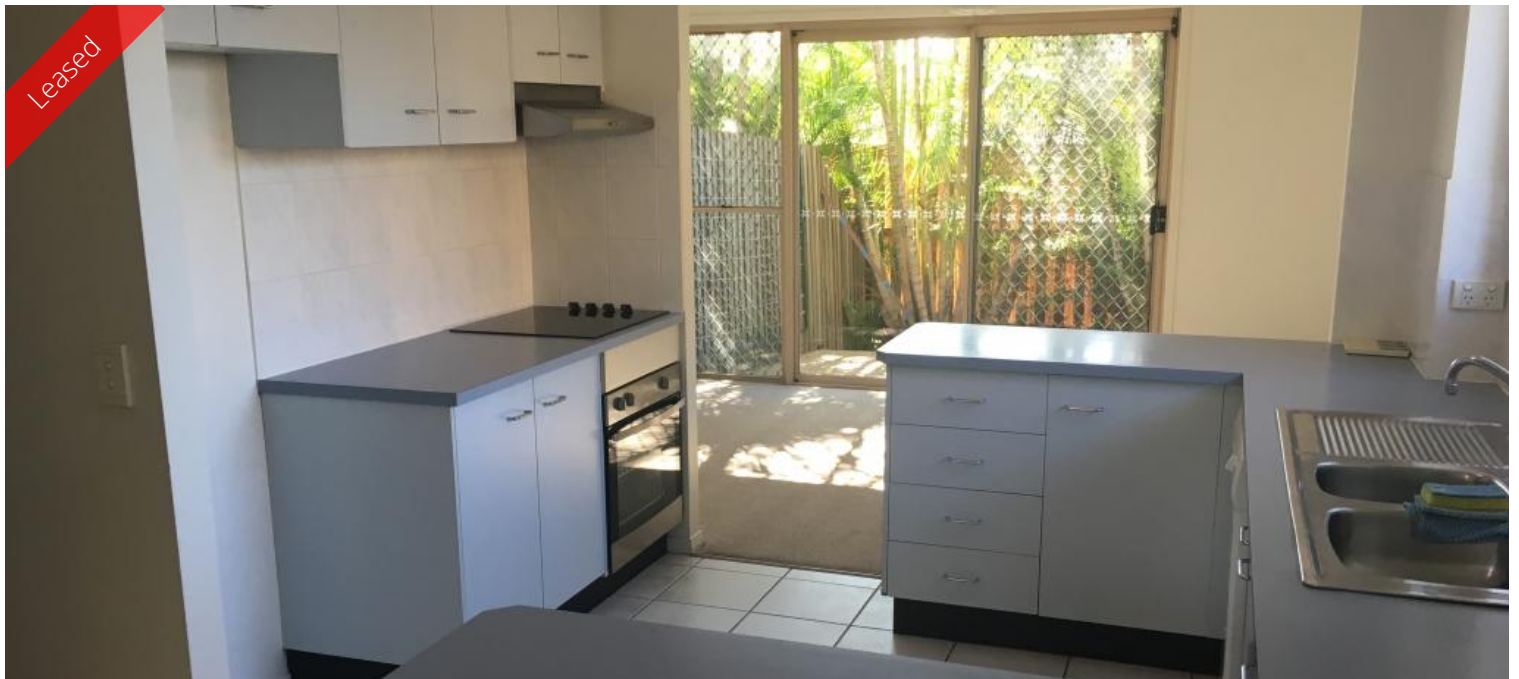
Unit 10, 1 Ivory St, Booval