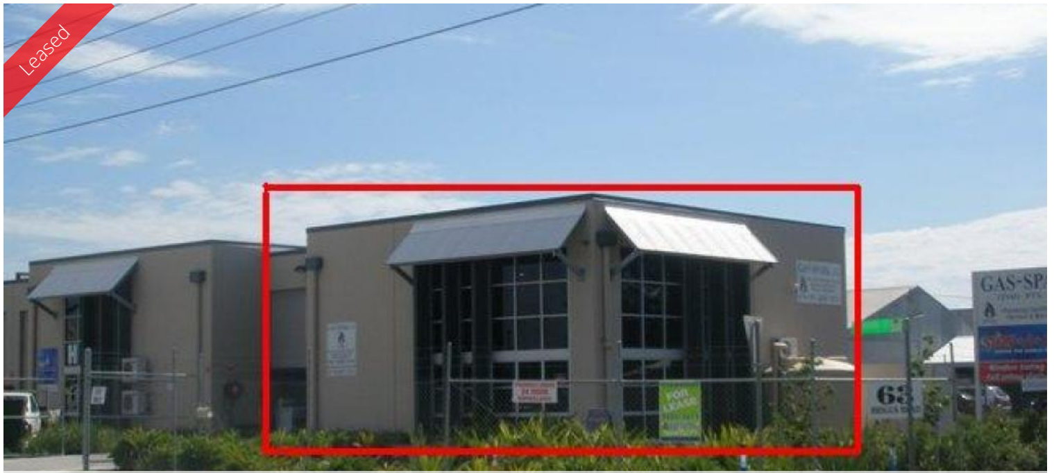
Unit 5, 63 Briggs Rd, Raceview