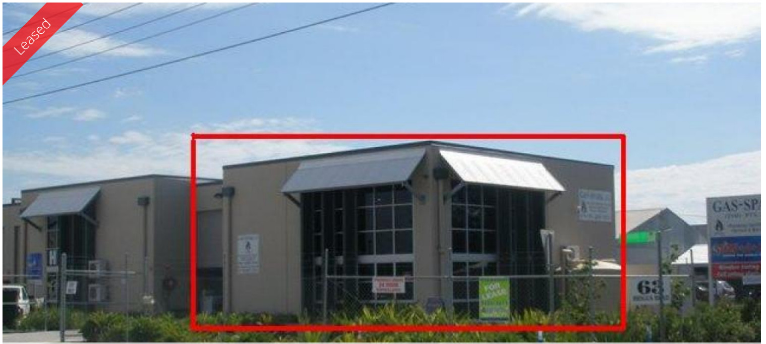
Unit 5, 63 Briggs Rd, Raceview