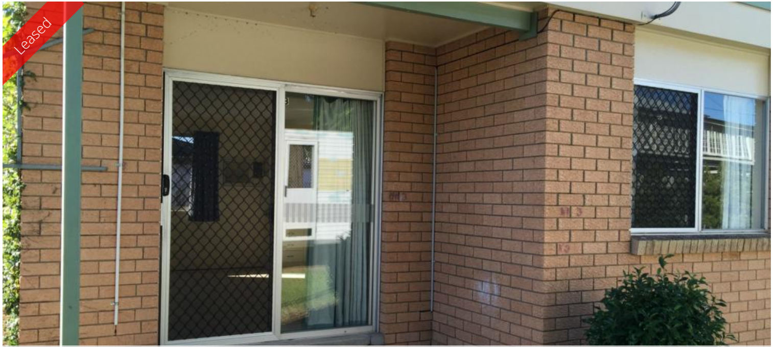
3, 22 Dudleigh Street, Booval