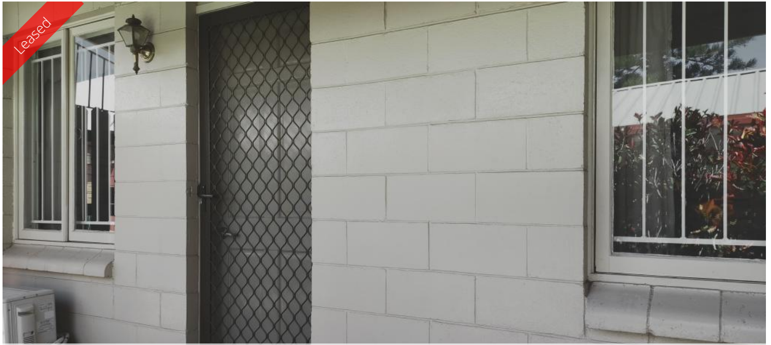
Unit 8, 39 Thorn St, Ipswich