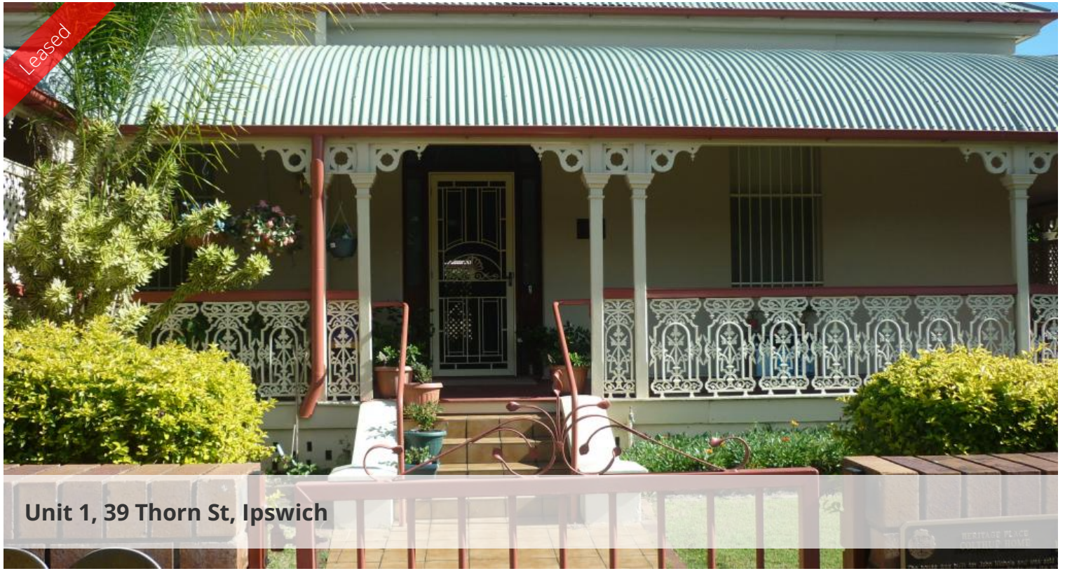
Unit 1, 39 Thorn St, Ipswich