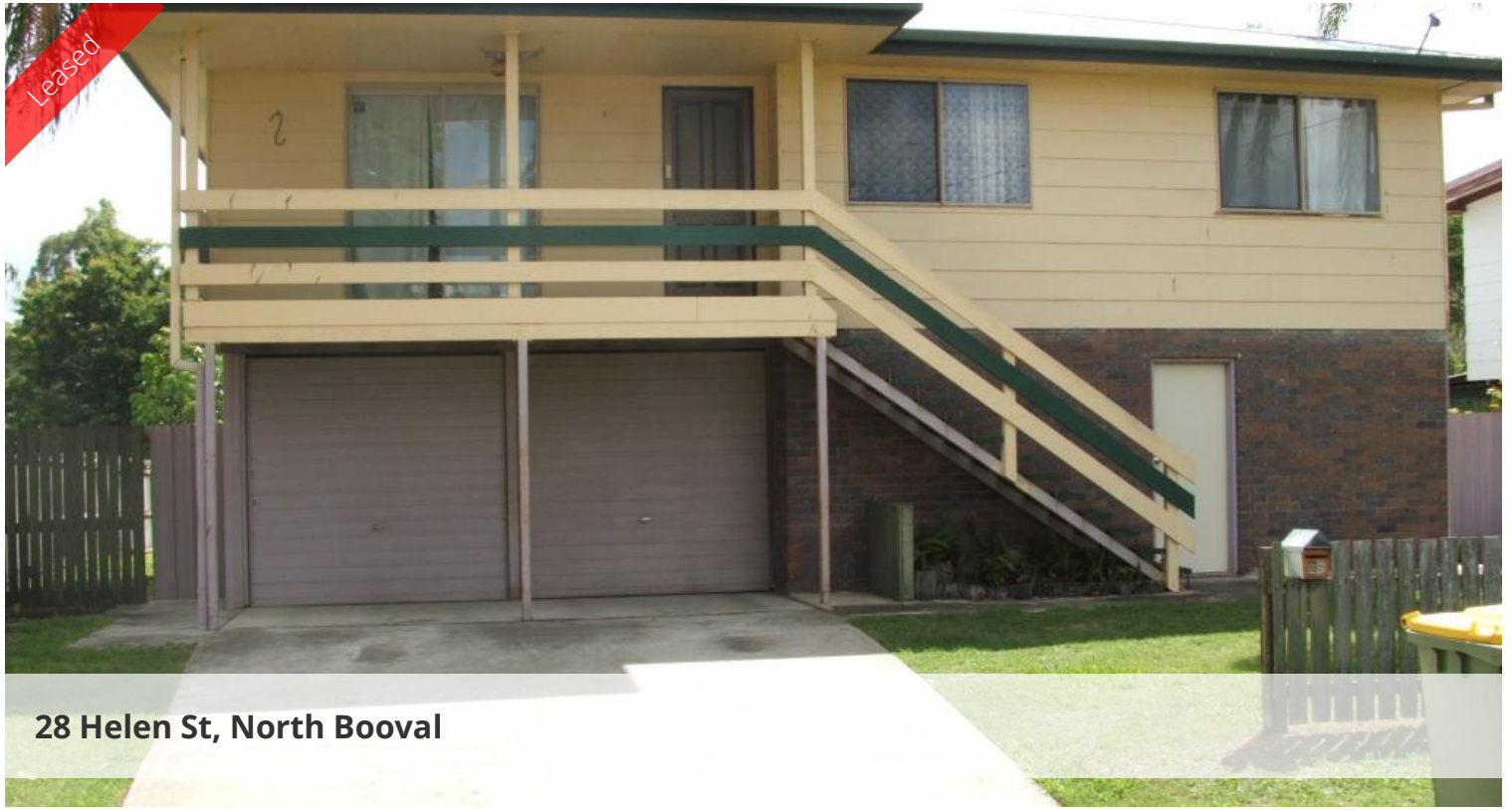
28 Helen St, North Booval