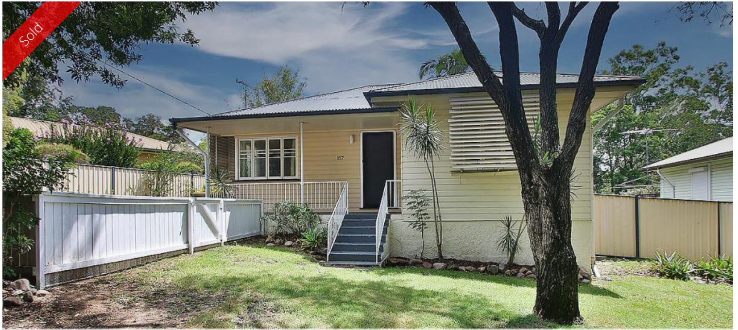
157 Pine Mountain Rd, Brassall