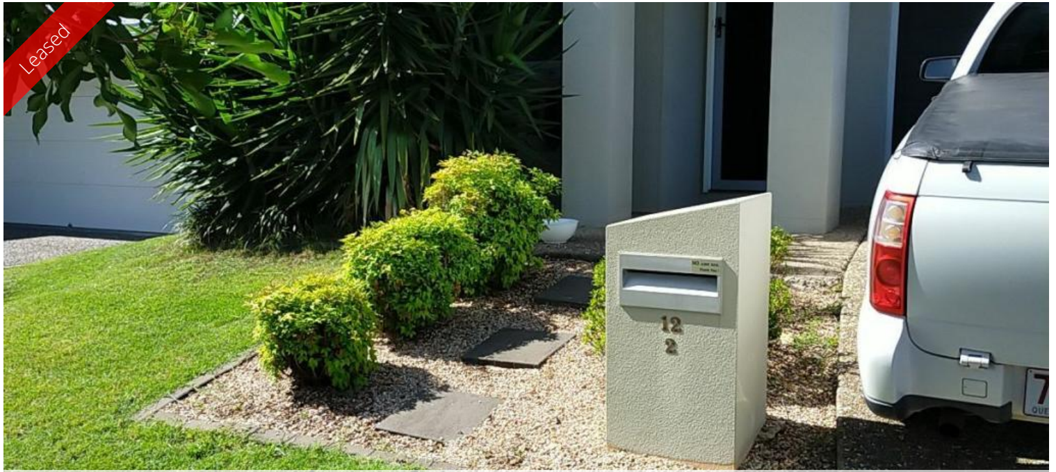
2, 12 Silky Oak Street, Ripley