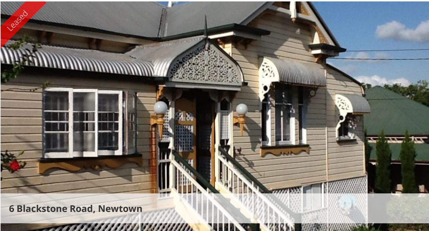
6 Blackstone Road, Newtown