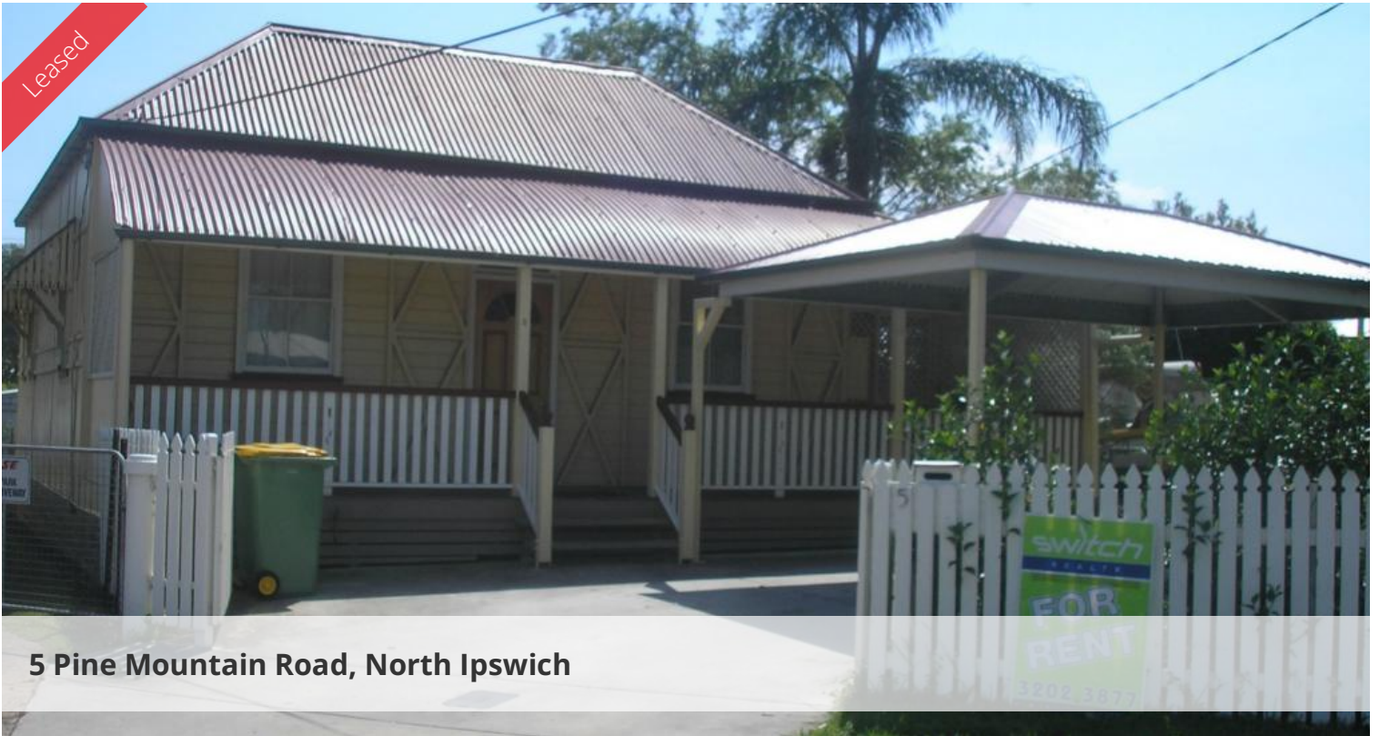
5 Pine Mountain Road, North Ipswich