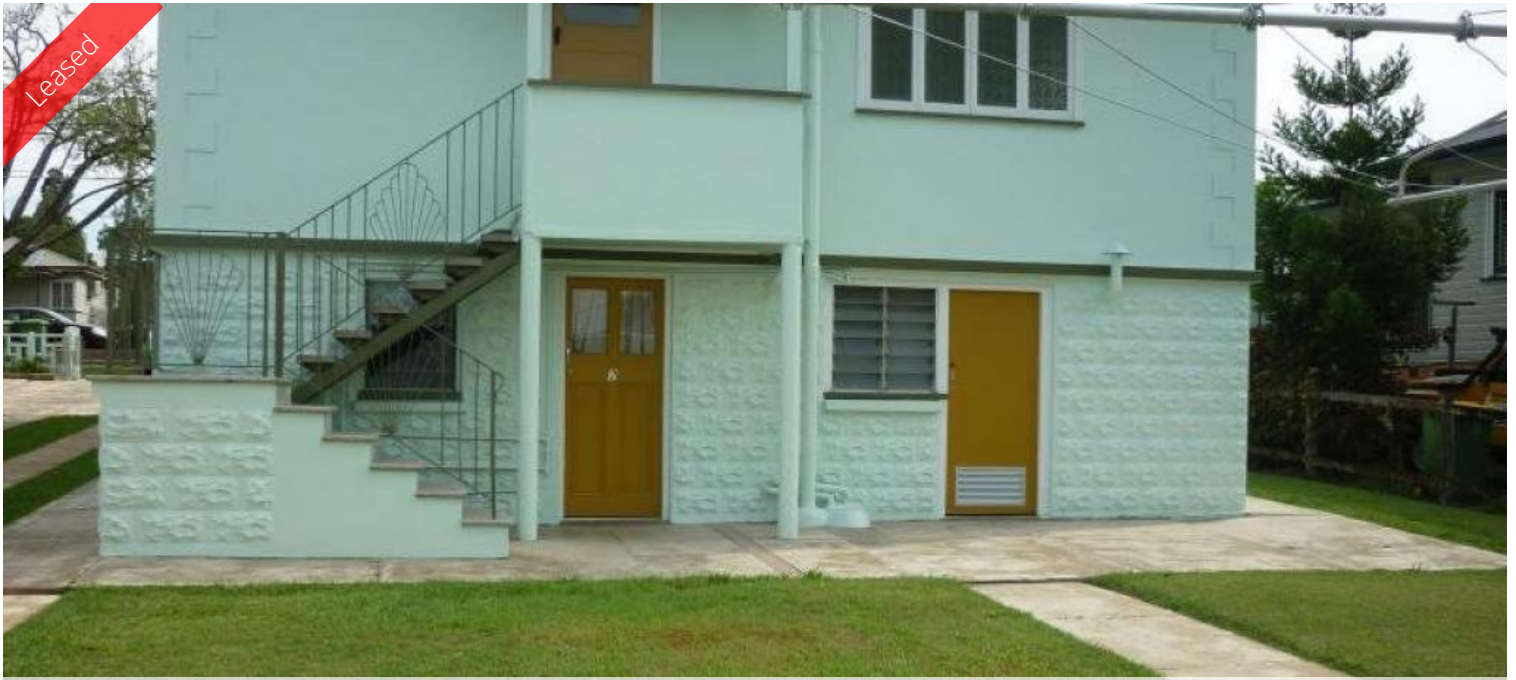
Unit 2, 7 Gray Street, Ipswich