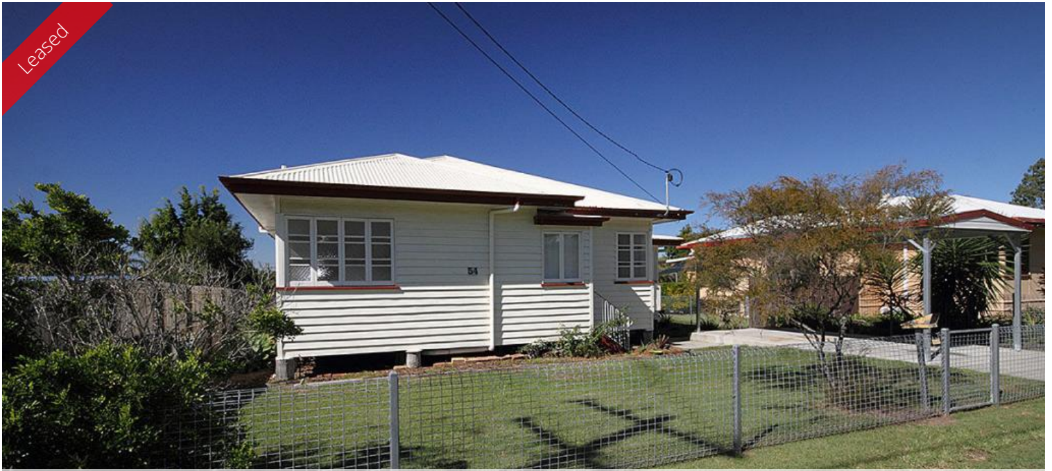
54a Bourke Street, Brassall