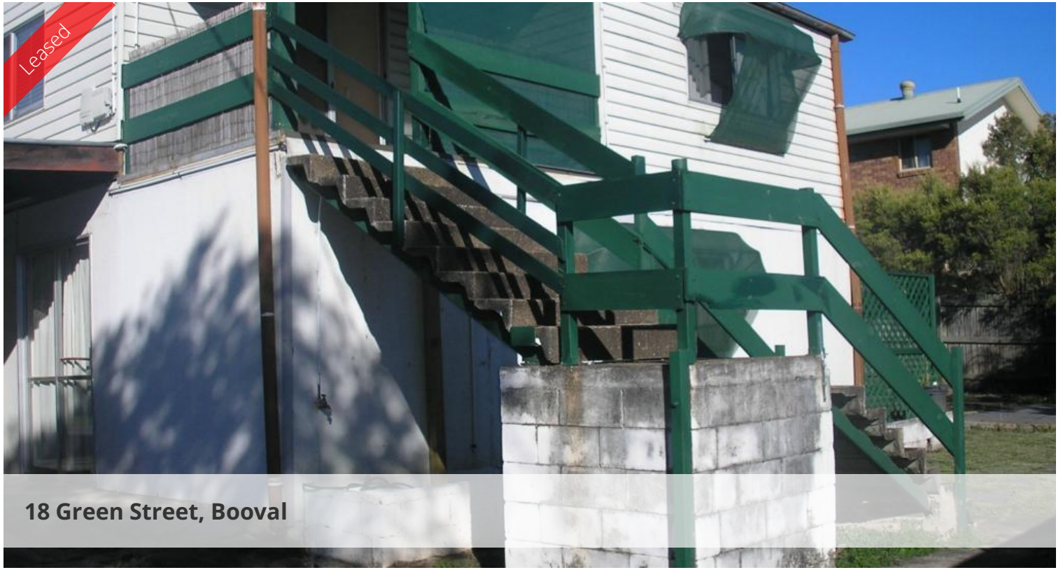
18 Green Street, Booval