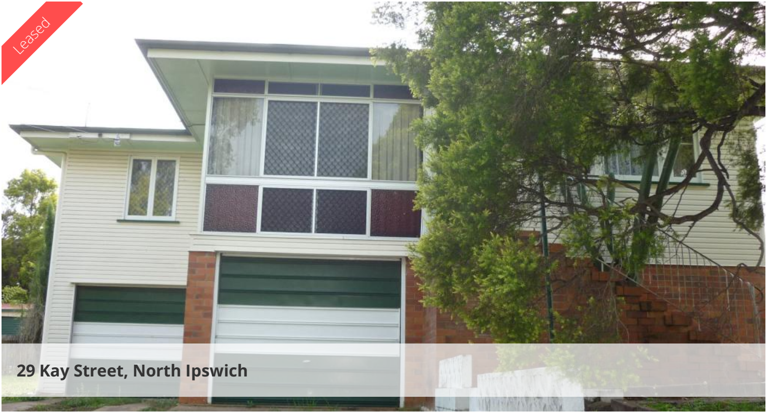
29 Kay Street, North Ipswich