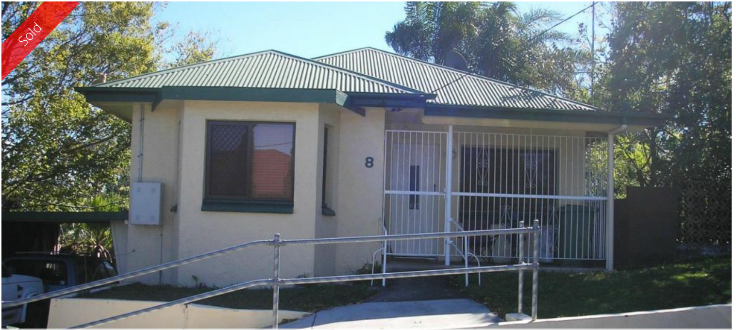
8 Tantivy Street, Tivoli