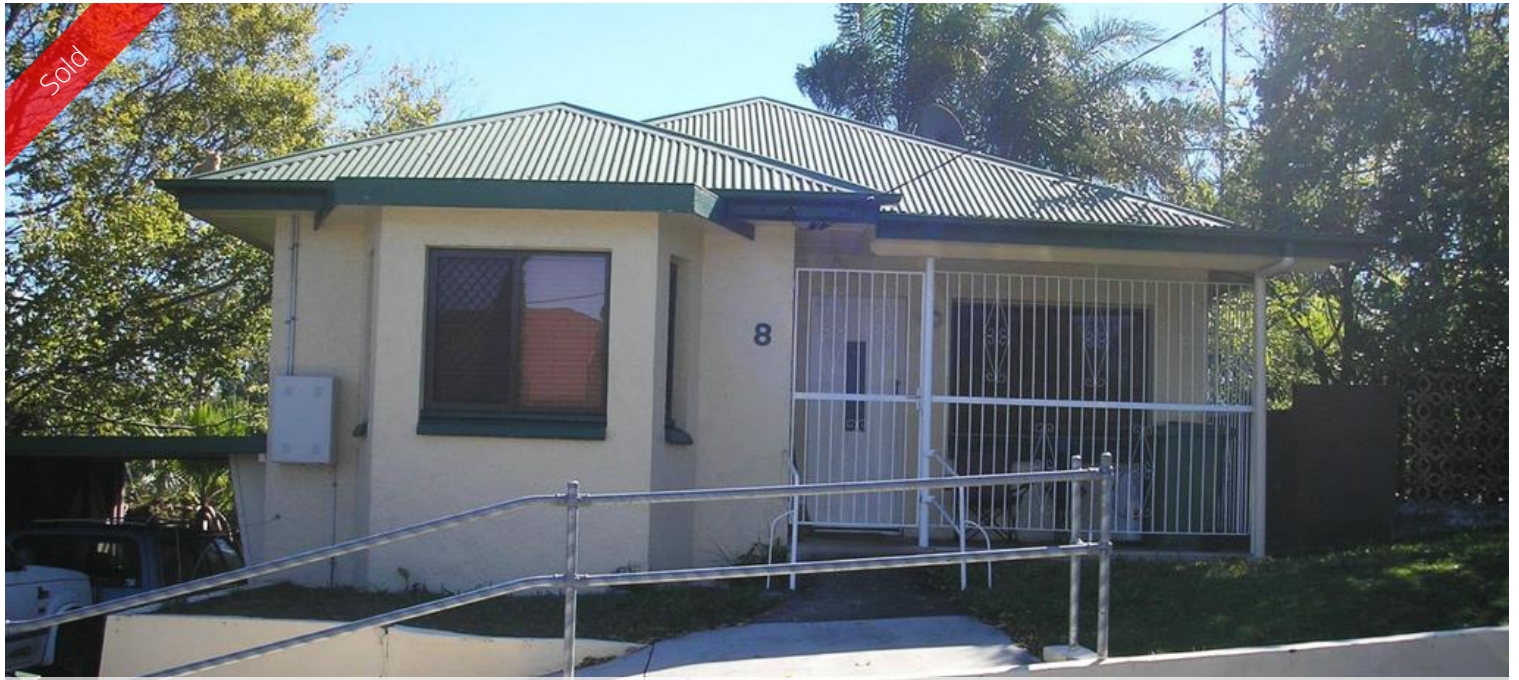
8 Tantivy Street, Tivoli