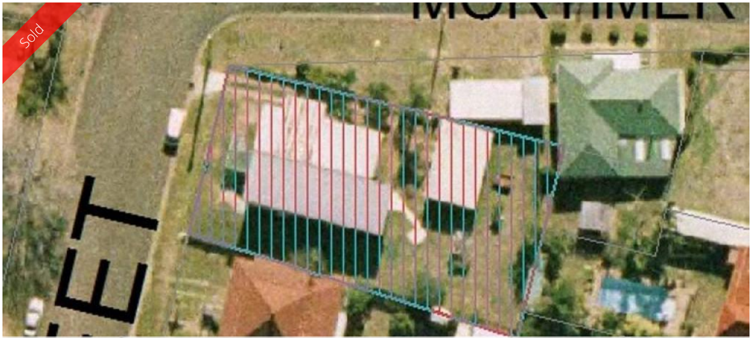
19 Mortimer Street, Ipswich